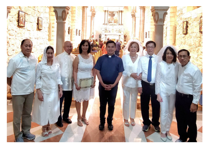
Renewal of Marriage Vows at the Church of Cana